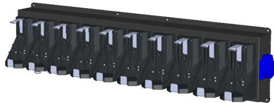
CR-25 and 10 x MLC