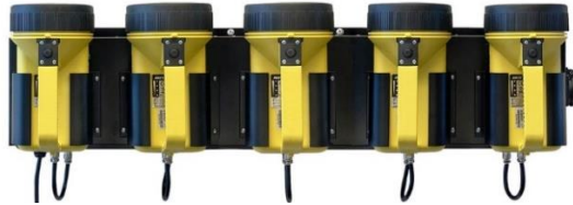
CR-25 and 5 x ILC / IL-640