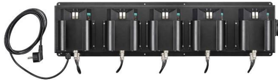
CR-25 and 5 x ILC